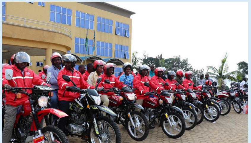
Cells Executive Secretaries in Nyamasheke receiving motorbikes

The initiative to give transport facilitation to Cells' Executive Secretaries countrywide is implemented in the framework of empowering grassroots entities to enable them offer quality and timely service to citizens.