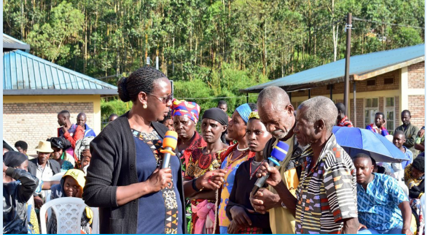
Rulindo District Mayor interacting with citizens during the Governance Month

The Governance Month in Rulindo District was carried out for the whole month of May under the theme "fighting all forms of injustice and promoting citizen-centered governance". The campaign consisted of different activities including awareness and education of citizens on different government programs, putting more emphasis on addressing citizens' queries. During this period, District leaders with other organs operating at district level toured all Sectors of the district to meet citizens, interact with them and solve their problems