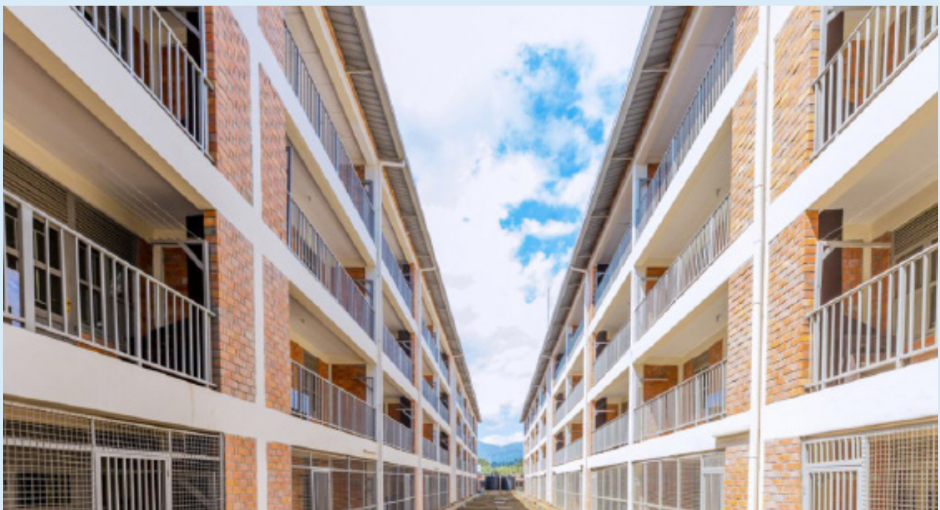
A model village with the capacity to host over 100 families relocated from high risks zones being constructed in Rubavu District is closer to completion.