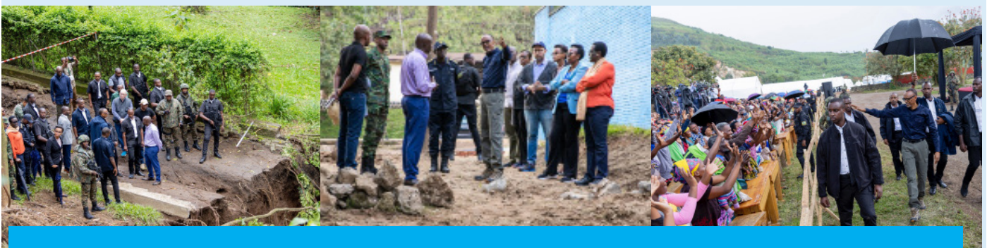
HE Paul Kagame visited different sites affected by disasters and met the survivors in Rubavu District

“We think of you and we are doing everything possible to help you in these tough times and very soon, you will go back to your usual life routine and