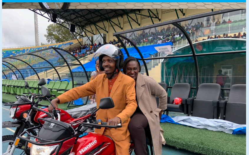
An Executive Secretary of one Cell in Huye District gives a ride to the Governor of Southern Province, after receiving his motorbike