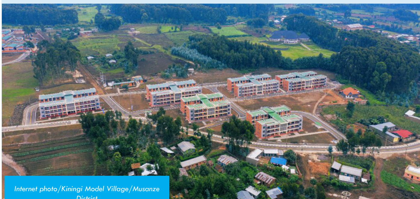
Internet photo/Kinigi Model Village/Musanze District

"Sustainable development is a result of many factors, including sound public finance management. Achieving clean audit means that; public funds allocated to districts were diligently utilized in the interest of the citizens. Moreover, it is a sign of multilevel collaboration, considering various players in the decentralized governance. RALGA dedicates this achievement to its members, the Government at large and development partners. We shall keep supporting our members towards excellence. Also, we shall continue the advocacy work and build necessary capacities at local level in order to overcome the prevailing challenges. We remain confident and hopeful that it is possible", said Ngendahimana Ladislav, Secretary General of RALGA.