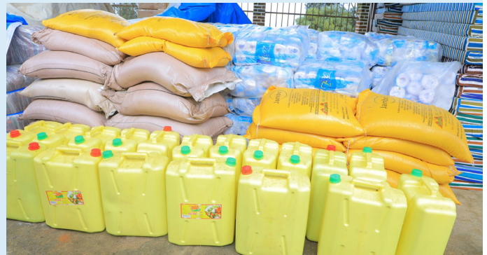
The government provided food and non-food items as emergency relief to the disaster victims