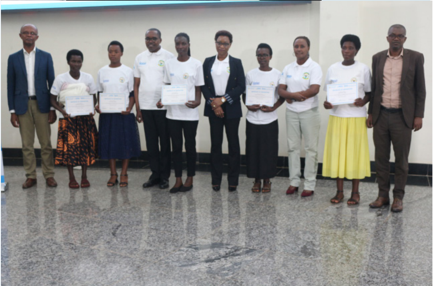
Beneficiaries of internships were awarded with certificates of completion