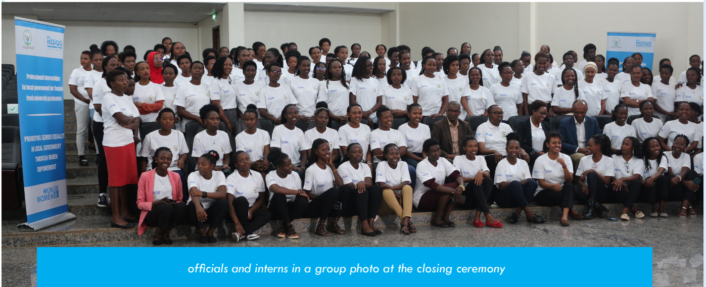
officials and interns in a group photo at the closing ceremony

Female fresh university graduates who completed their internships in local government have expressed enthusiasm and greater aspiration to serve in local governments, so that they can play a role in Rwanda's transformation journey.