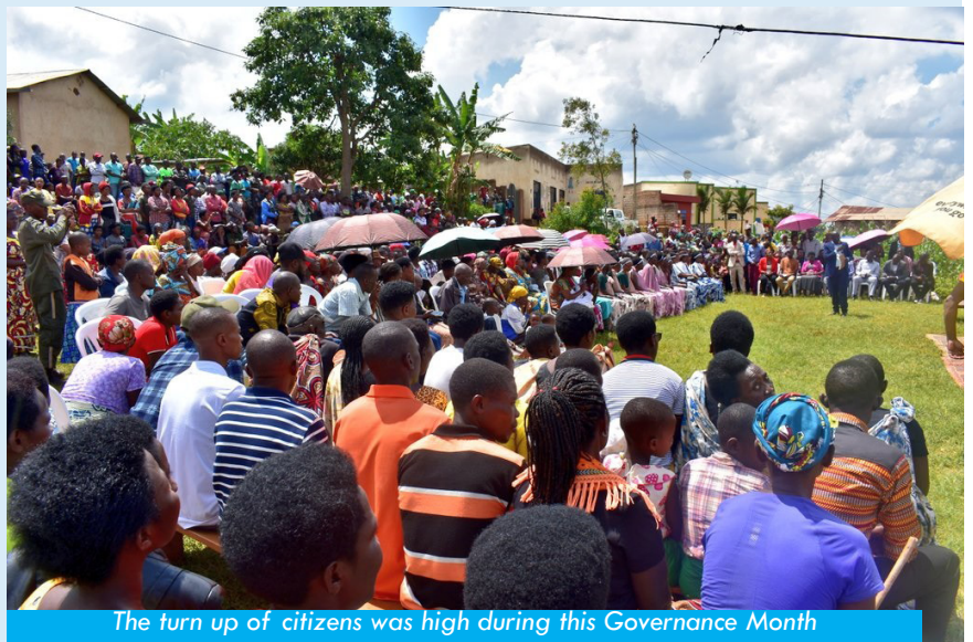
The turn up of citizens was high during this Governance Month

The Governance Month in Rulindo District was carried out for the whole month of May under the theme "fighting all forms of injustice and promoting citizen-centered governance". The campaign consisted of different activities including awareness and education of citizens on different government programs, putting more emphasis on addressing citizens' queries. During this period, District leaders with other organs operating at district level toured all Sectors of the district to meet citizens, interact with them and solve their problems